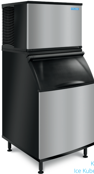
Koolaire KT-1000 Ice Kube Machine on K570 Bin

Koolaire by Manitowoc ice machines are designed, developed and tested by Manitowoc engineers to provide great ice production, energy efficiency and reliable service at an affordable price.